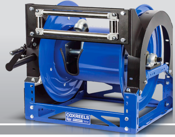
1600 Series with optional universal bracket kit, 4-way roller bracket, crank handler holster & bevel gear crank